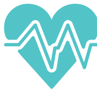
Cardiology & Emergency Medicine