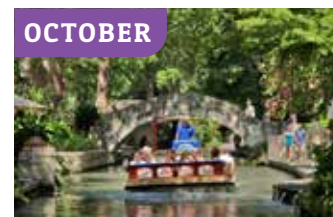
San Antonio, TX October 3-6, 2023