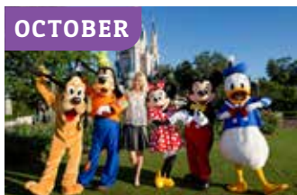
Orlando, FL October 16-19, 2023