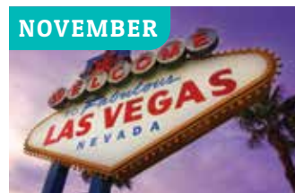
Las Vegas, NV November 14-17, 2023

To learn more information and additional event details, visit: