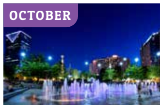
Atlanta, GA October 24-27, 2023