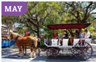
Savannah, GA May 1-4, 2023