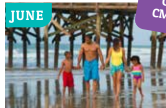
Myrtle Beach, SC June 26-29, 2023