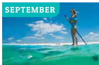
Pensacola Beach, FL September 12-15, 2023