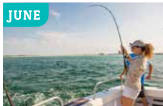
Destin, FL June 13-16, 2023