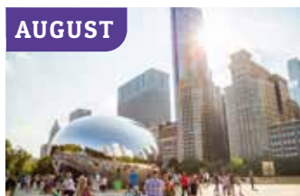
Chicago, IL August 29-September 1, 2023