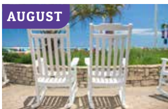
Virginia Beach, VA August 8-11, 2023